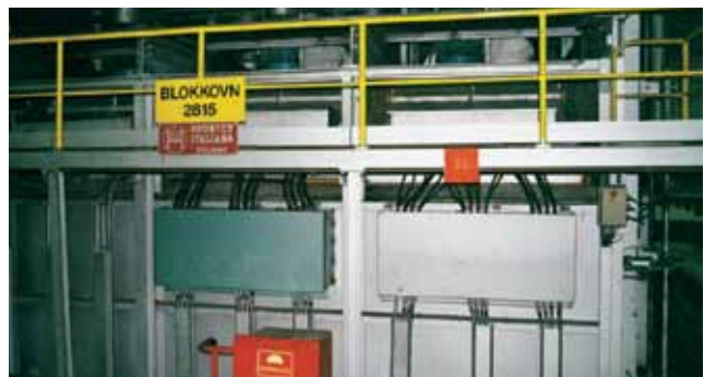
One furnace side with the electrical connections for two of the air heating cassettes, installed from the furnace roof.