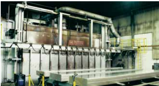
The pusher furnace at Hydro Aluminium Holmestrand with Kanthal air heating cassettes. The 7-ton slabs are heated to 600°C (1110°F) before rolling.

Preheating before hot rolling takes place in an electrically heated pusher type convection furnace originally built by Heurtey Italiana in 1985. The temperature is 590–600°C (1090–1110°F). The 7-ton slabs are produced at the smelting shop at Holmestrand and stored at the furnace. Production is continuous, stopping only for a couple of weeks at summertime for annual maintenance.