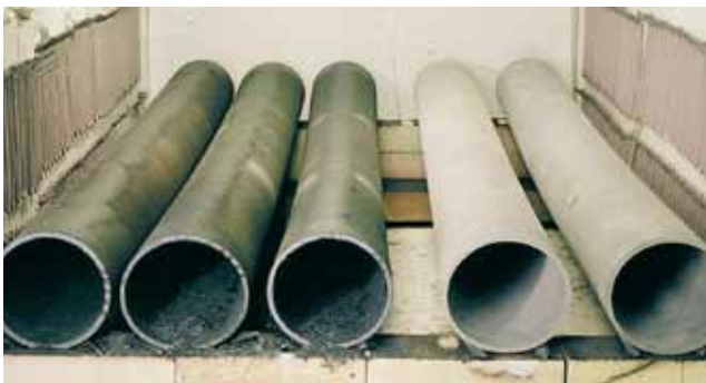
Comparison between nickel-chromium tubes at left and Kanthal APM tubes after 1000 hours at 1150°C (2100°F). The NiCr tubes are severely contaminated with oxide flakes while Kanthal APM tubes are clean.

A severe problem with the nickel-chromium system was that the oxide flakes filled the outer tube to such an extent that the gas circulation was stopped and the lower part of the tubes were overheated.