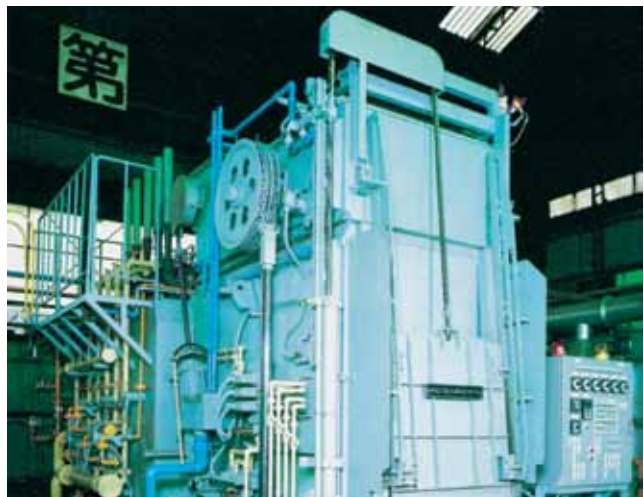
One of the ten gas heated 200 kW universal furnaces with 10 inner and outer vertically mounted Kanthal APM tubes.

Outer tubes: 115 x 104 x 1435 mm (4.5 x 4.1 x 56.5 in) Inner tubes: 75 x 66 x 1500 mm (3.0 x 2.6 x 59.1 in)