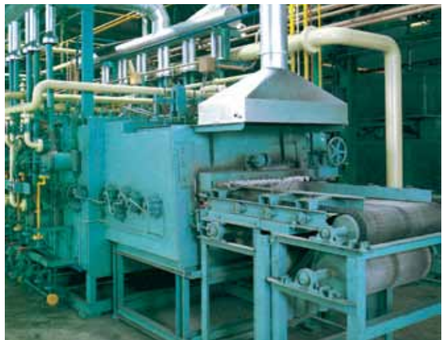
520 kW continuous gas heated furnace at Koyo Heat Treatment with 26 horizontal Kanthal APM inner tubes.

Outer tubes: 115 x 104 x 1435 mm (4.5 x 4.1 x 56.5 in) Inner tubes: 75 x 66 x 1500 mm (3.0 x 2.6 x 59.1 in)